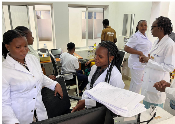
DCMC sustains meaningful, secure employment for 154 staff, the majority of whom are women.

DCMC's expanded NICU cares for 5 infants a day, on average, giving parents peace of mind that their babies are receiving the extra support they need.