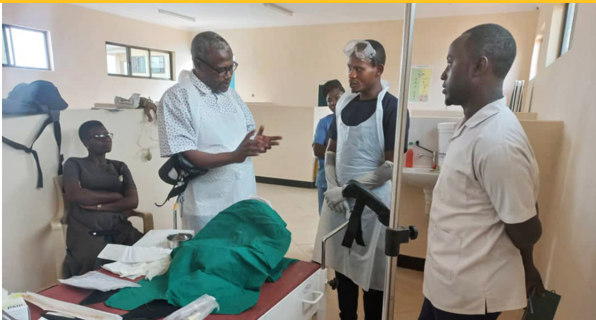
DCMC facilitates emergency obstetric care (EMOC) training for rural health providers.