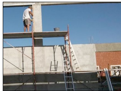
Expansion continues on Dodoma Innovation & Production Company's (DIPC) water bottling plant. This separate, for-profit business is committed to helping support DCMC.