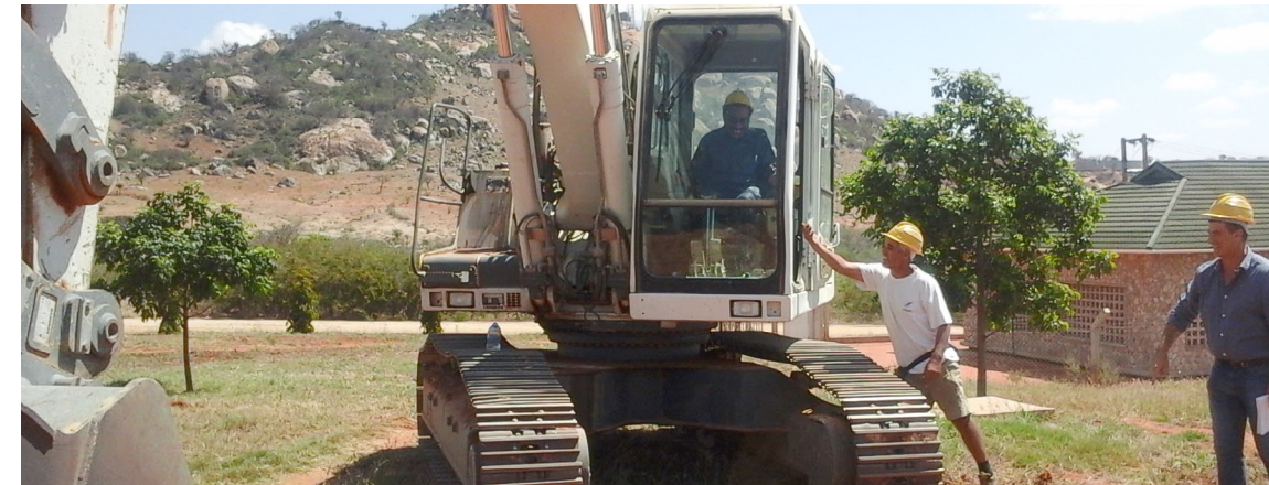
Tanzania's Minister of Health Dr. Seif Rashid takes the first excavator dig for the expansion of Dodoma Christian Medical Center. The 5,000 square-foot addition will add badly-needed patient beds, additional consultation rooms, and dedicated spaces for endoscopy and CT scans.

For the most recent photos and updates, Click Here and Like our Facebook page.